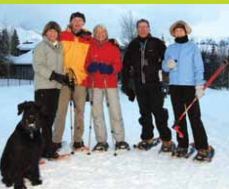
2009 Twilight Snowshoe